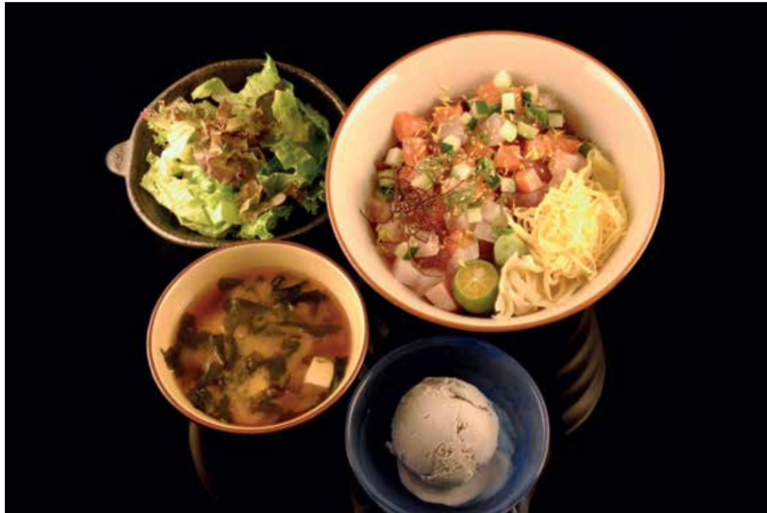
Airways Bara Chirashi Sushi Set

(Only available during Lunch Hours 12pm-2.30pm)