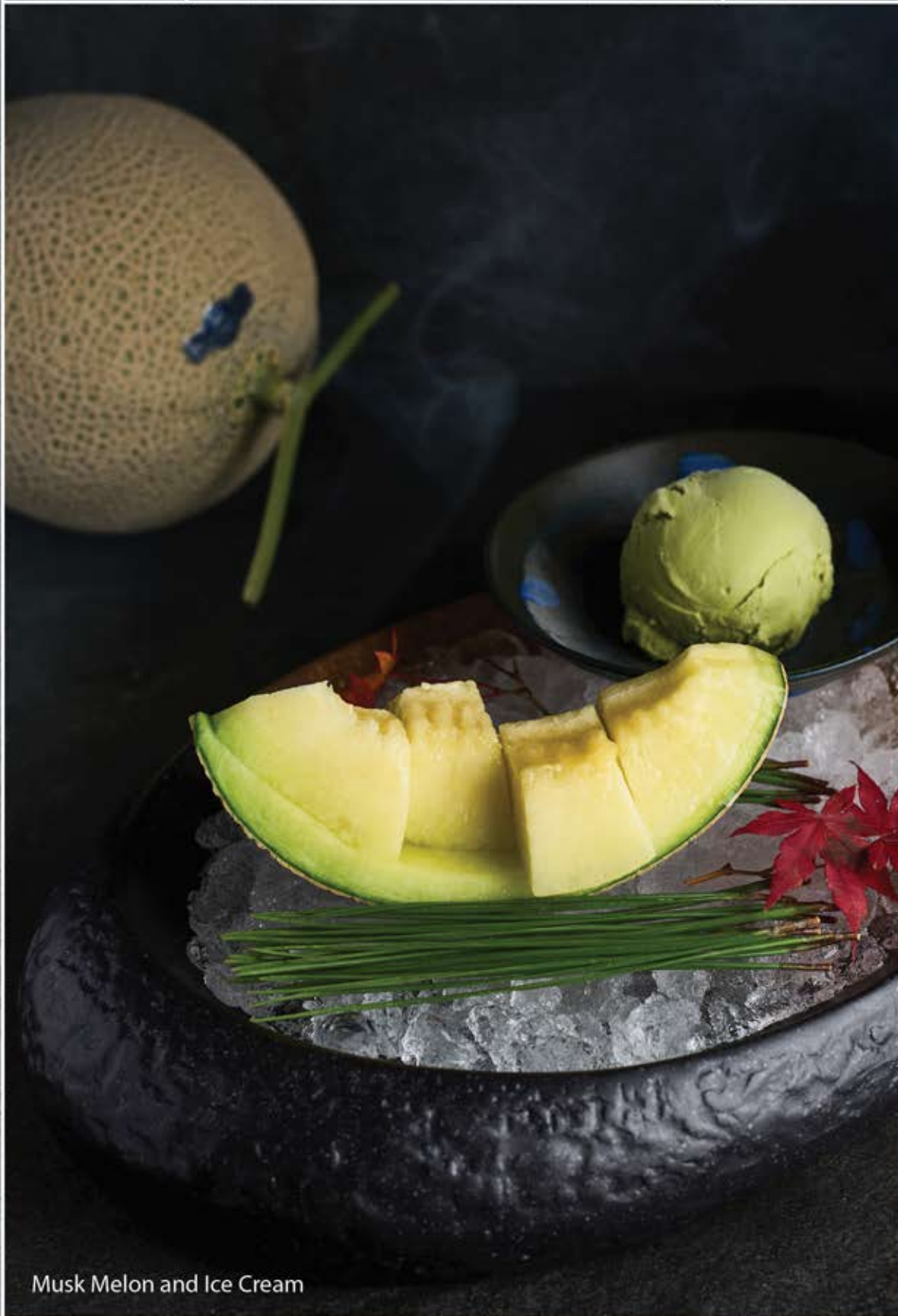
Musk Melon and Ice Cream