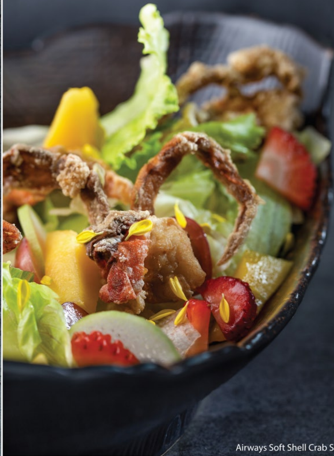
Airways Soft Shell Crab Salad